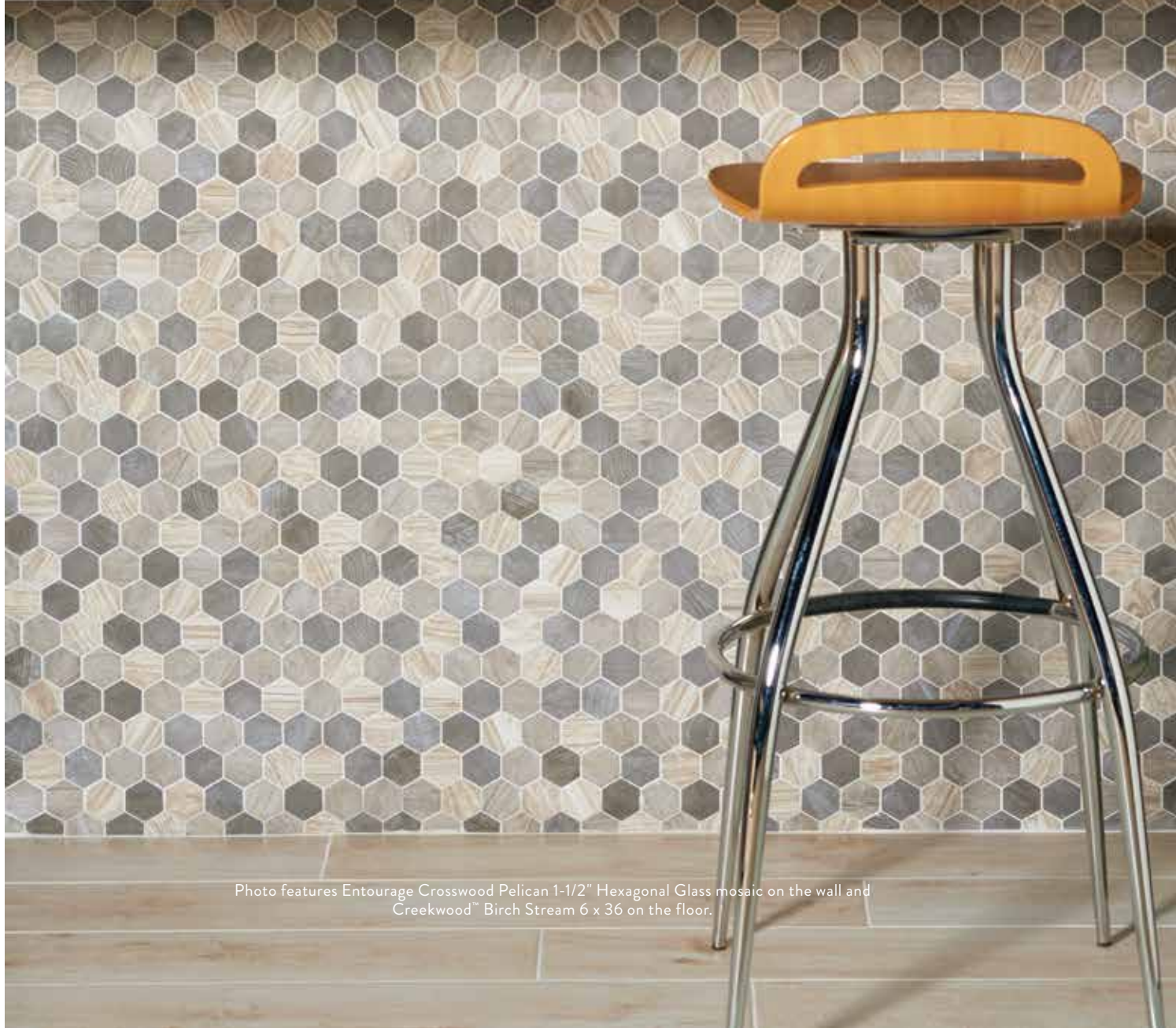
Photo features Entourage Crosswood Pelican 1-1/2" Hexagonal Glass mosaic on the wall and Creekwood™ Birch Stream 6 x 36 on the floor.