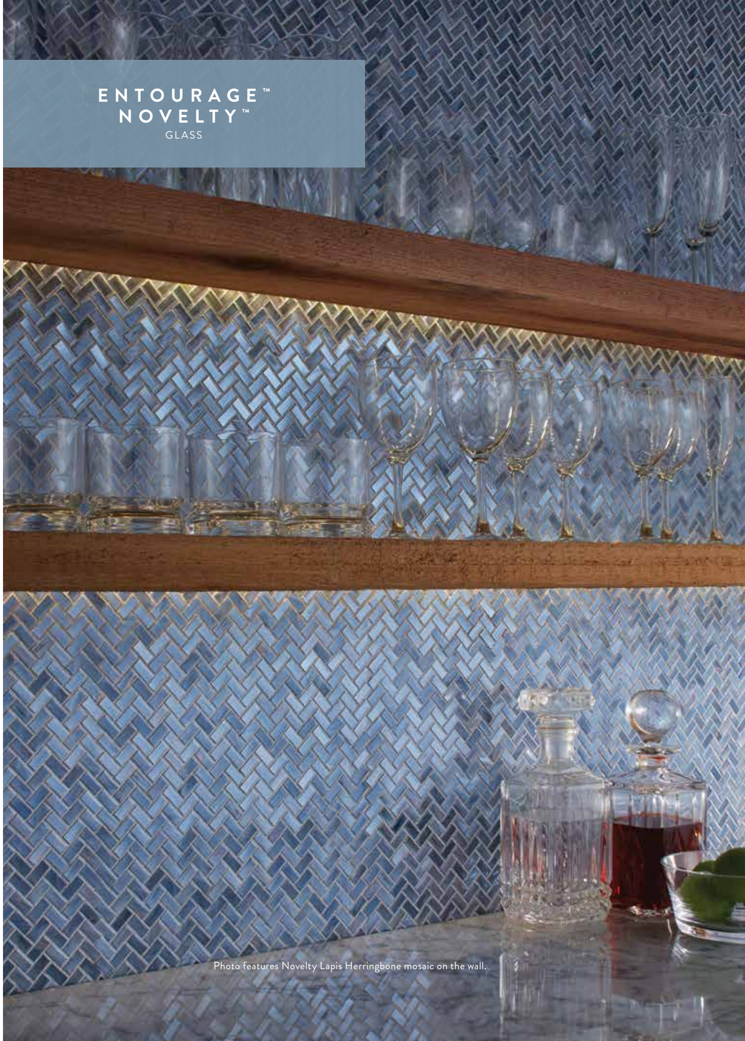
Photo features Novelty Lapis Herringbone mosaic on the wall.