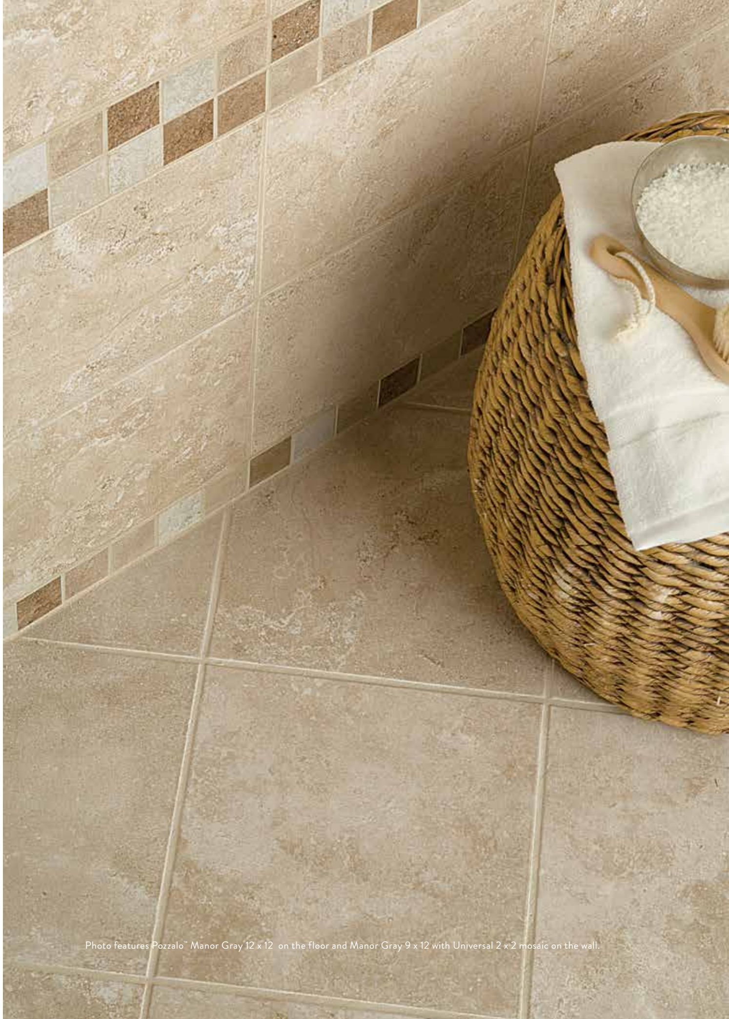
Photo features Pozzalo™ Manor Gray 12 x 12 on the floor and Manor Gray 9 x 12 with Universal 2 x 2 mosaic on the wall.