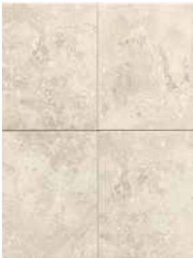
SAIL WHITE PZ91