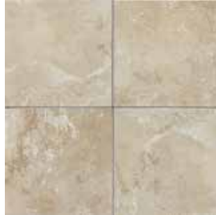
MANOR GRAY PZ94