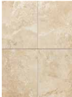
MANOR GRAY PZ94