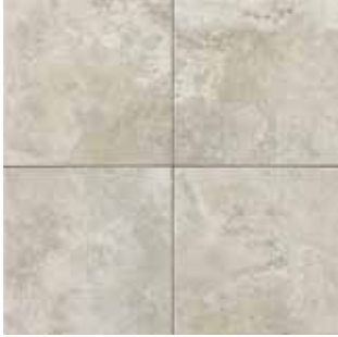
SAIL WHITE PZ91