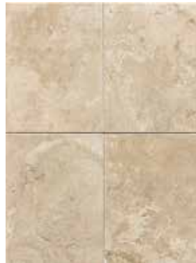
COASTAL BEIGE PZ92