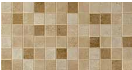
UNIVERSAL PZ99 (Sail White, Coastal Beige, Weathered Noce, Manor Gray)