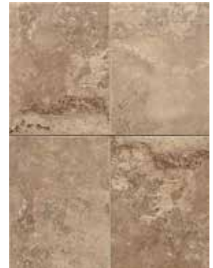
WEATHERED NOCE PZ93