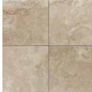
COASTAL BEIGE PZ92