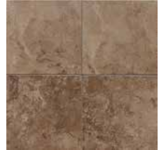
WEATHERED NOCE PZ93