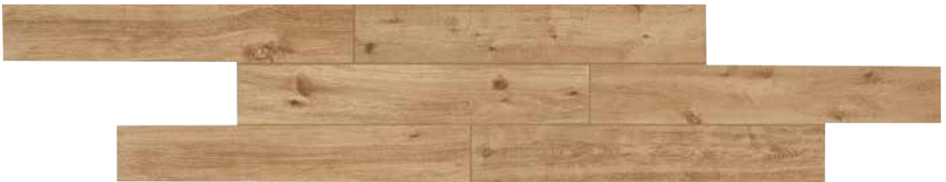
MAPLE LAKE CW97