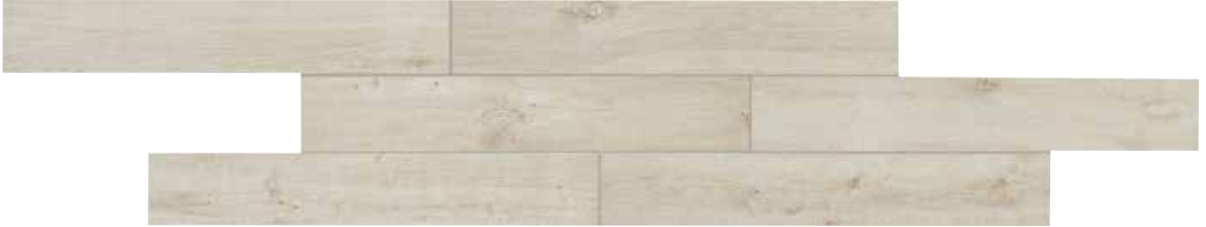
BIRCH STREAM CW96