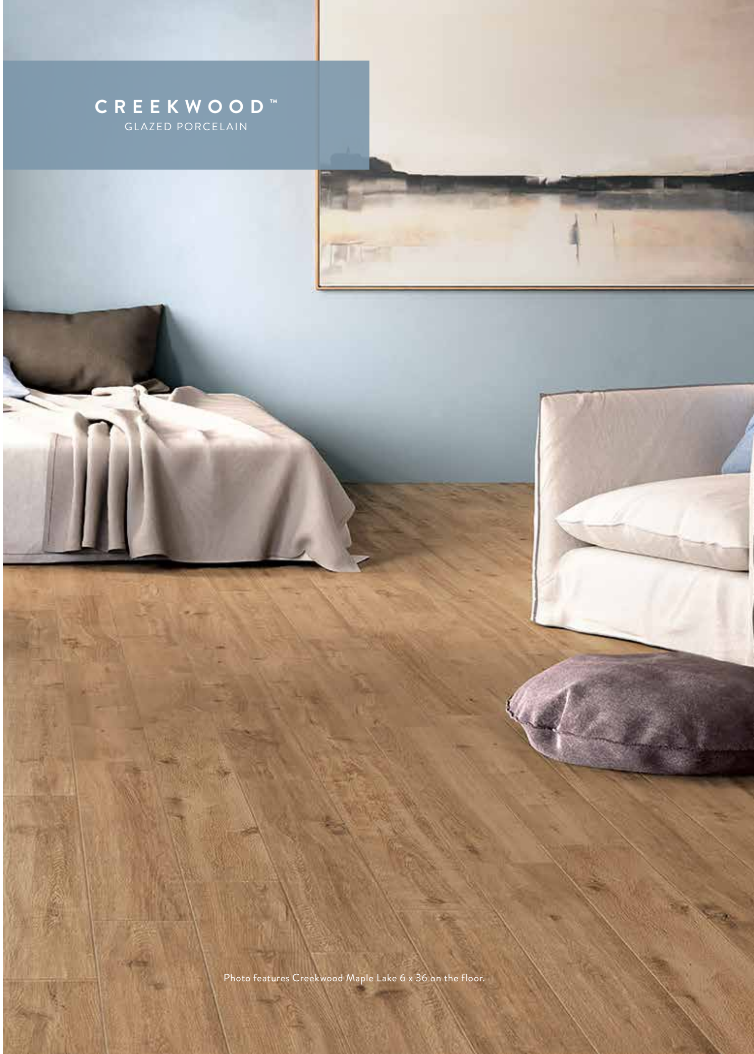
Photo features Creekwood Maple Lake 6 x 36 on the floor.