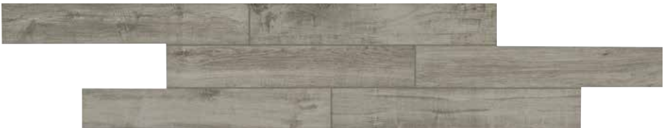
ASH RIVER CW99