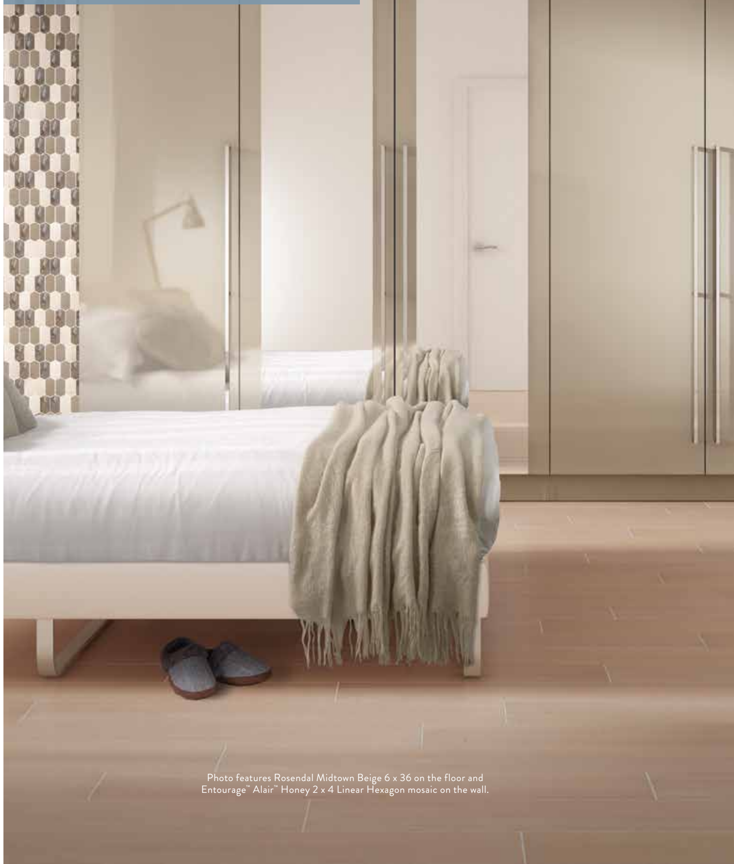
Photo features Rosendal Midtown Beige 6 x 36 on the floor and Entourage™ Alair™ Honey 2 x 4 Linear Hexagon mosaic on the wall.