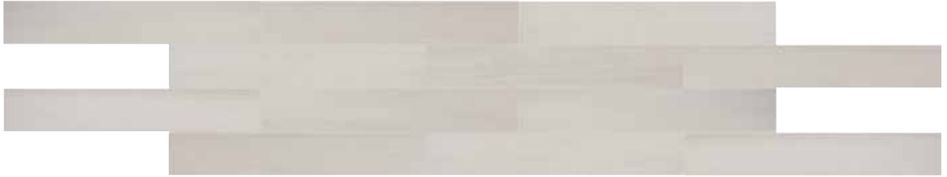
ALABASTER MOTIF RD12