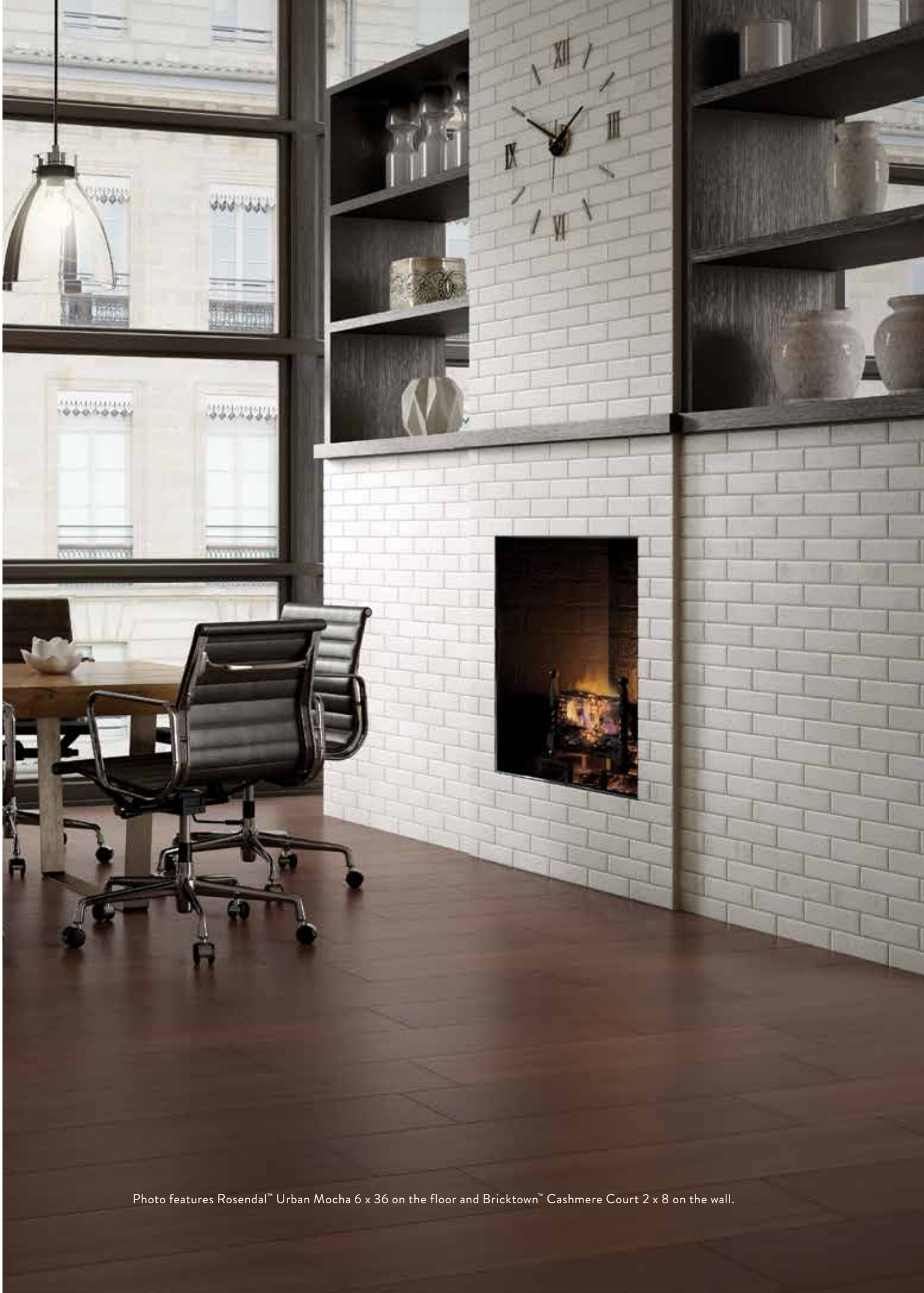
Photo features Rosendal™ Urban Mocha 6 x 36 on the floor and Bricktown™ Cashmere Court 2 x 8 on the wall.