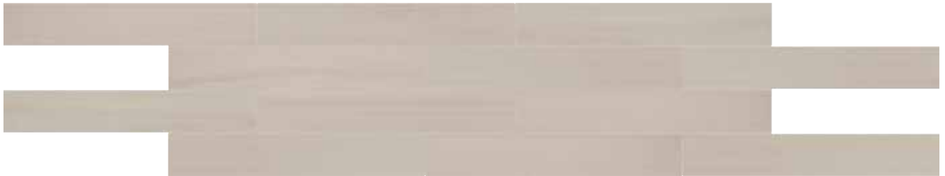
METRO GRAY RD13