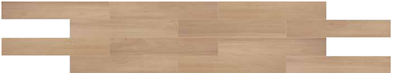
MIDTOWN BEIGE RD14