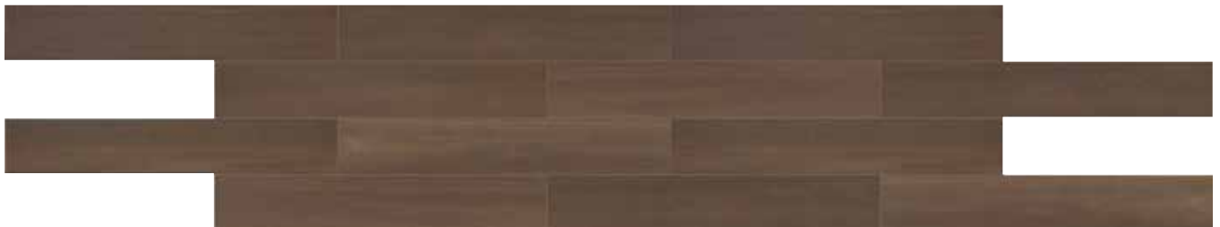
URBAN MOCHA RD11