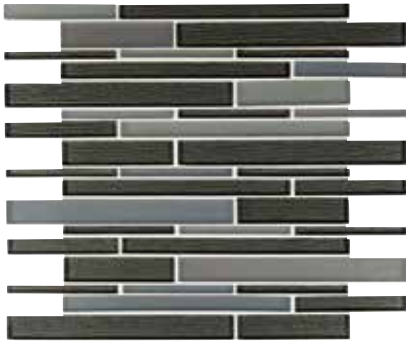
METAL METHOD ST73