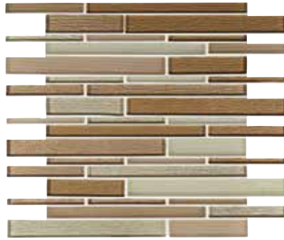
COPPER CONCEPTS ST74