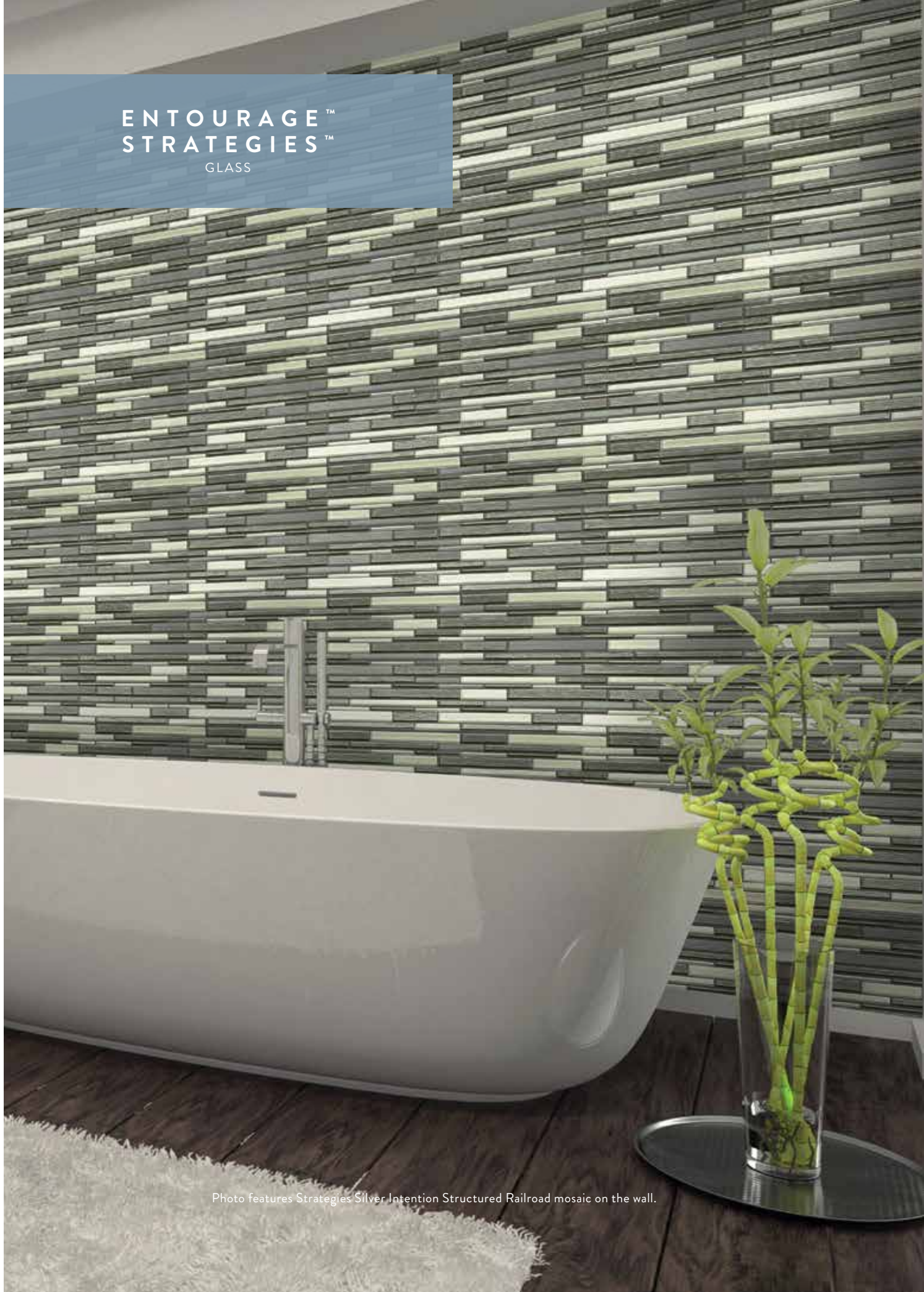
Photo features Strategies Silver Intention Structured Railroad mosaic on the wall.