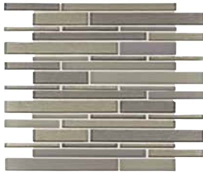
TAUPE TACTICS ST77