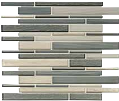
SILVER INTENTION ST76