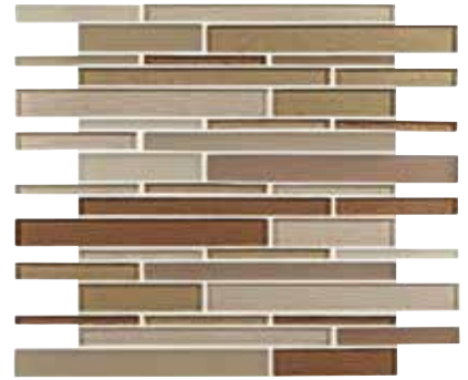
BRONZE BENEFITS ST75