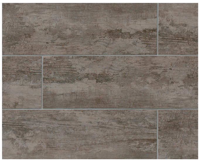
Black Oak - B TCRWV29B - 8"x36" Matte