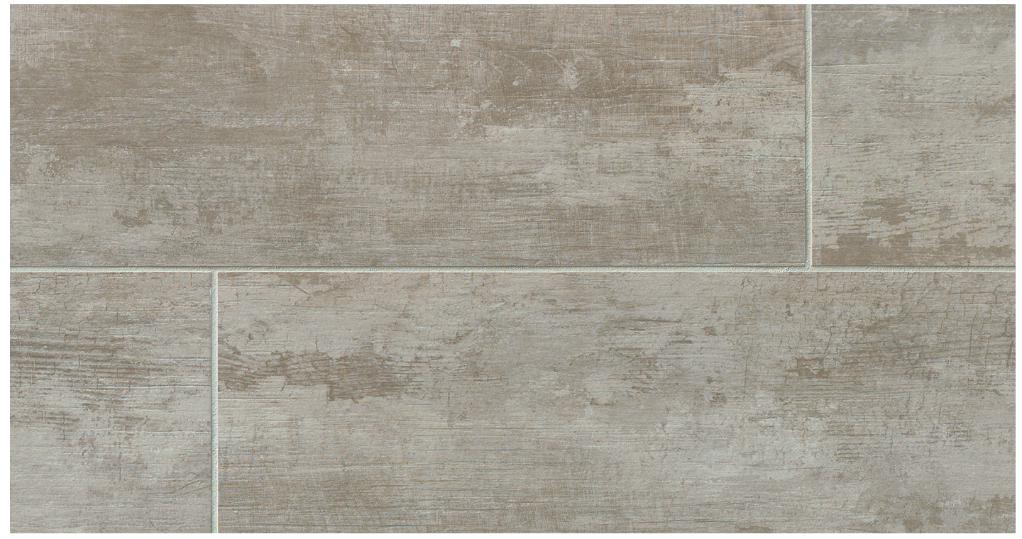
Silver - S TCRWV29S - 8"x36" Matte