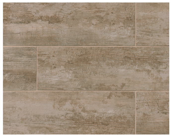
Camel - C TCRWV29C - 8"x36" Matte