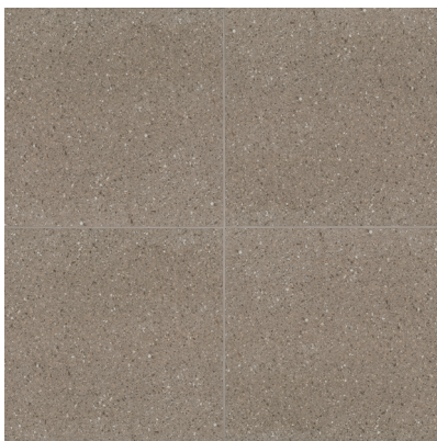
Medium Gray - MG TCRTER25MG - 10"x10" Matte TCRTER50MG - 20"x20" Matte