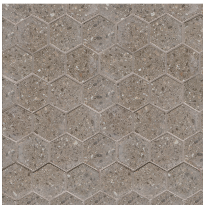
Medium Gray - MG TCRTER221HEXMG