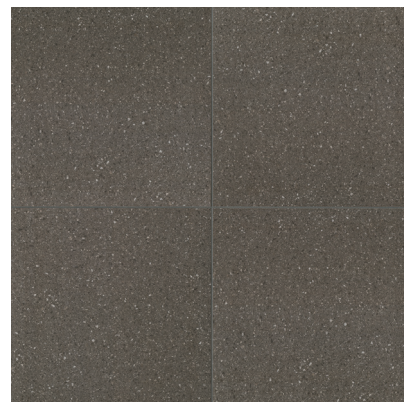
Dark Gray - DG TCRTER25DG - 10"x10" Matte TCRTER50DG - 20"x20" Matte