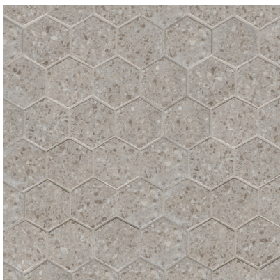
Light Gray - LG TCRTER221HEXLG