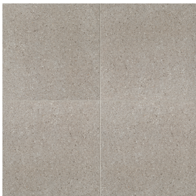
Light Gray - LG TCRTER25LG - 10"x10" Matte TCRTER50LG - 20"x20" Matte