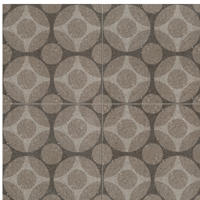
Light Gray, Medium Gray & Dark Gray TCRTERDEC150