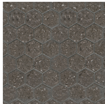
Dark Gray - DG TCRTER221HEXDG